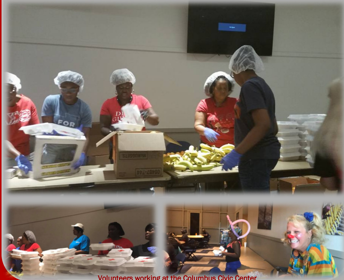
Volunteers working at the Columbus Civic Center

Members of the CAC and MAC Disaster Relief Teams were out in full force volunteering in September when thousands of Hurricane Irma evacuees sought shelter in Columbus, Georgia.