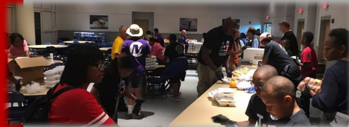
Volunteers working at the Columbus Civic Center