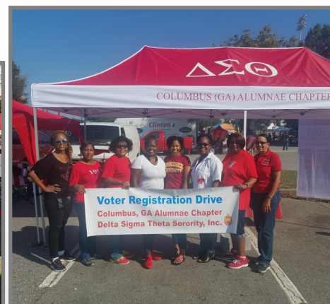
Voter Registration Drive held during the Tuskegee-Morehouse Football Tailgate