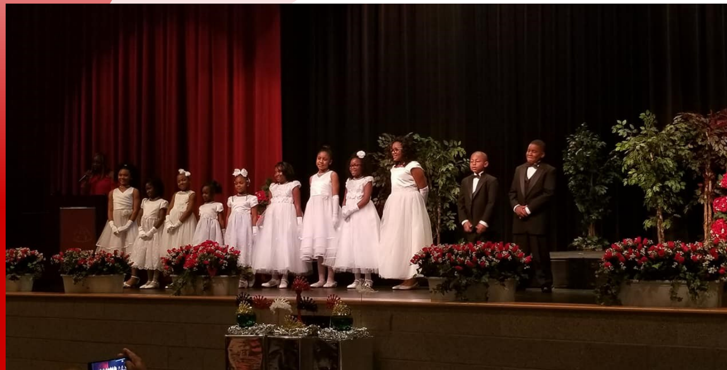
Our 2018 Jabberwock Contestants