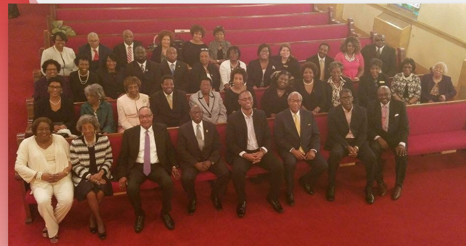
National Panhellenic Council Unity Church Service at First African Baptist Church.