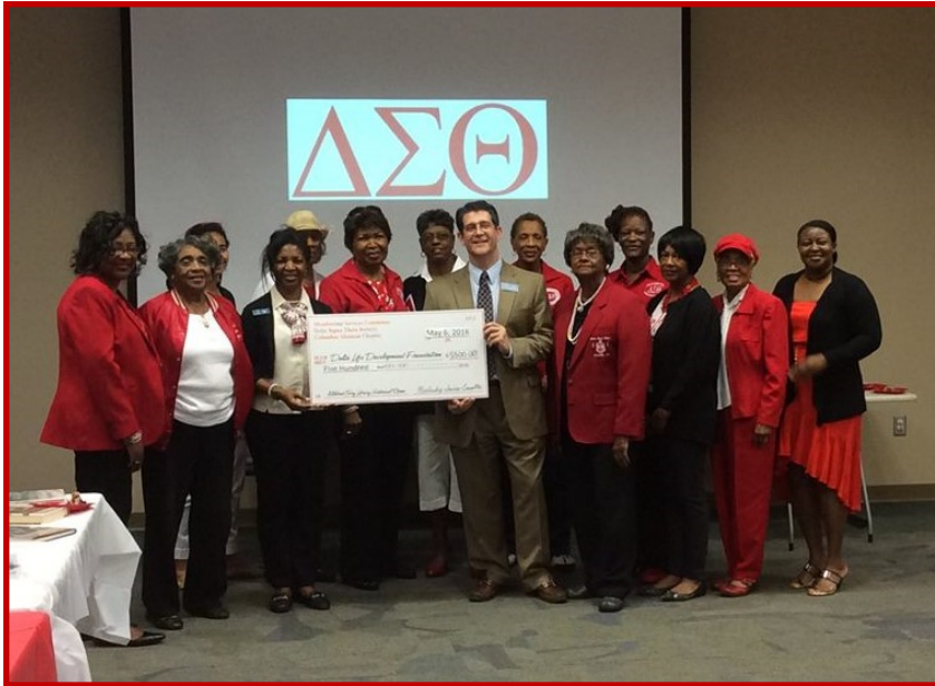
Delta Days at the Mildred Terry Public Library